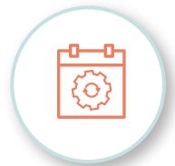
Fewer Routine Service Calls