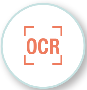
Optical Character Recognition

Higher Duty Cycles and Periodic Maintenance Intervals provide greater volume with fewer routine service calls so you can stay focused on productivity.