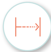
Soft Close Drawers